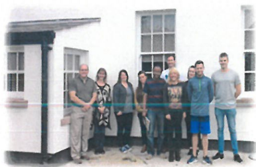
First intake of St Vincent's MQTVI