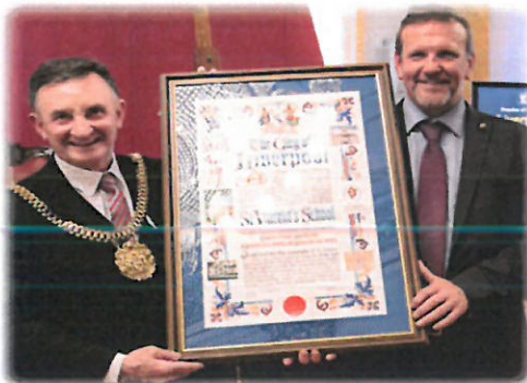
Freedom of the City