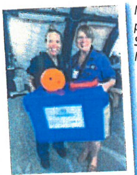
Me presenting Sightbox on Mersey Ship.