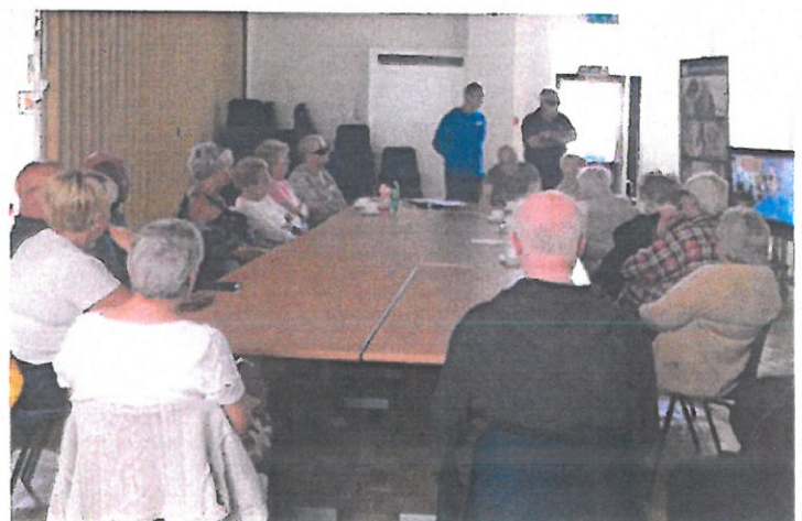
Friends from Sheffield & Rotherham Blind Society attending our Charles Bonnet Group – sharing good practice!

At the Hub we are offering a facility where people can come to receive support and information about living with sight loss. We demonstrate the latest equipment and technology, and run comprehensive Living with Sight Loss Courses. We facilitate regular support groups including Macular Society, Retina UK and Charles Bonnet Syndrome which are well attended as well as maintaining close links with Bradbury Fields. We also partner national organisations including Visionary, Blind Veterans UK, Guide Dogs and RNIB, as well as other local sight loss charities.